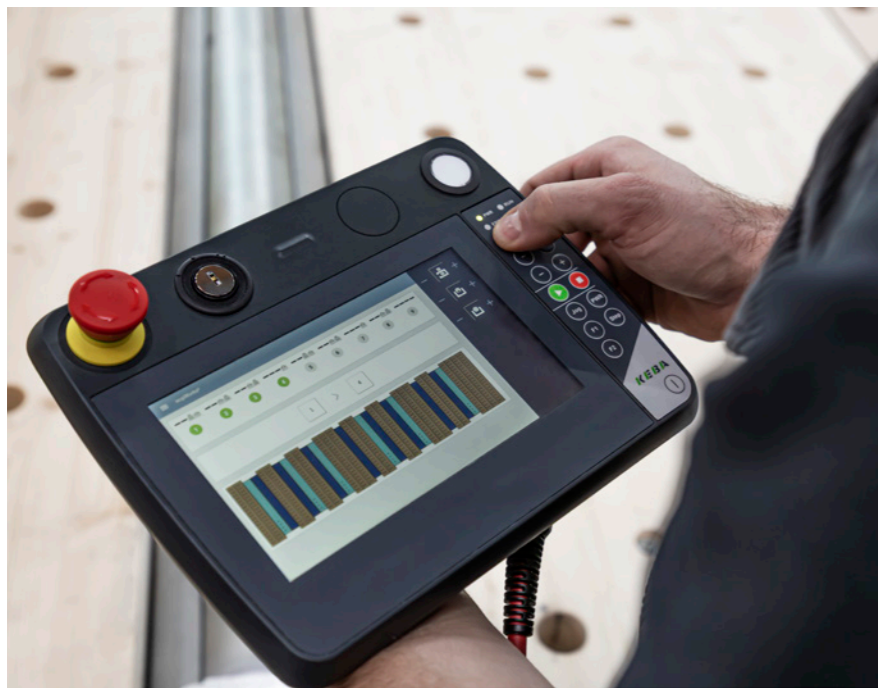
Simple control via the mobile operating device