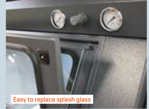
Easy to replace splash glass