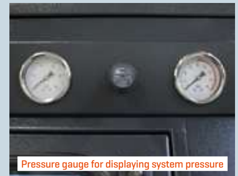
Pressure gauge for displaying system pressure