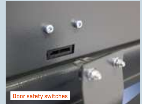
Door safety switches