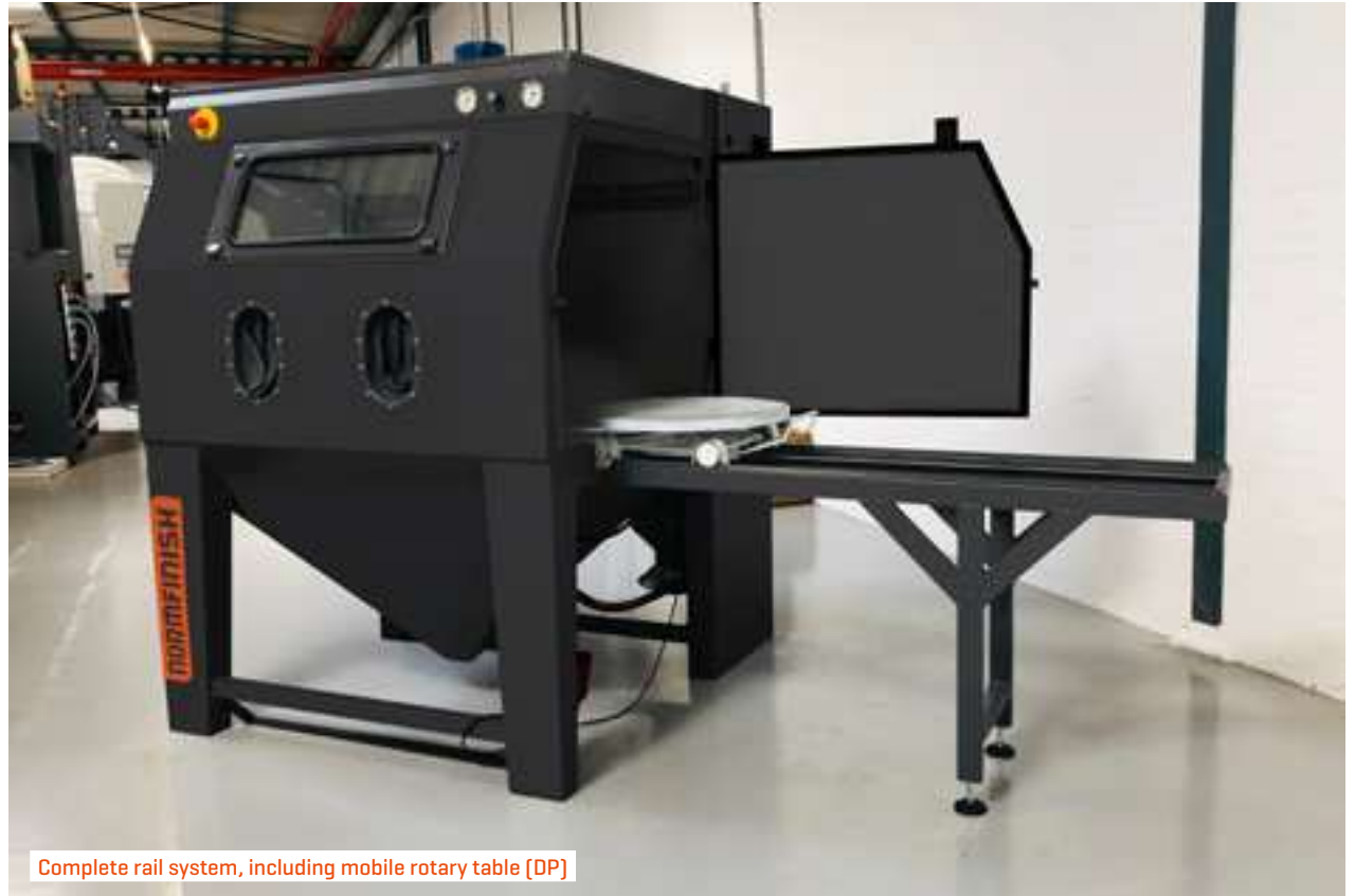
Complete rail system, including mobile rotary table [DP]