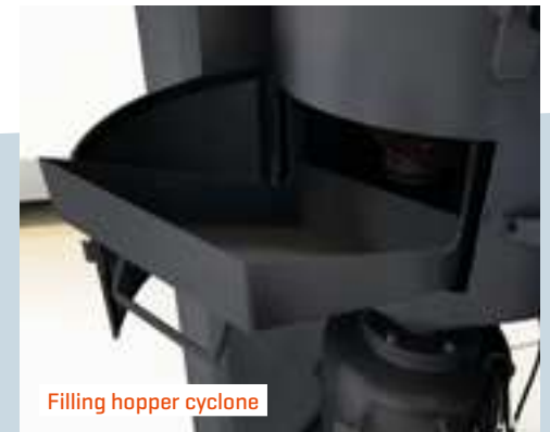
Filling hopper cyclone