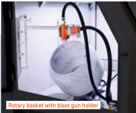
Rotary basket with blast gun holder