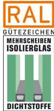
RAL Quality Label 520/2-3